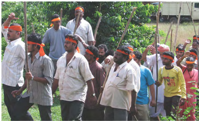
Militant Hindu nationalists threaten Indian Christians.