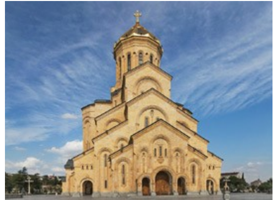
Pray that Georgia's government will reach a fair and sustainable solution.

While such legislation is only at the stage of deliberation, pray that Georgia's governmental agencies and representatives will fairly consider all sides of the discussion. Pray that freedom of religion will continue being made available to all, without partiality. Ask the Lord to guide the words of those who are seeking to raise their concerns. Despite the present religion law debate, may there be an ongoing spread of the Gospel throughout the nation.