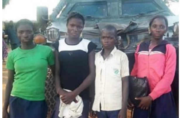
Four of the kidnapping victims from Engravers' College.

If you would like to post a prayer of praise or petition on behalf of our persecuted family around the globe, visit VOMC's prayer wall .