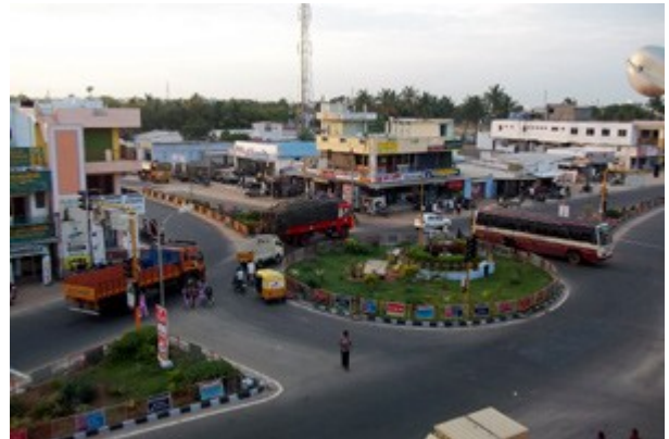
Tirruppur District

India is officially a secular nation and courts have repeatedly stated that no permission is required for worship in homes. This has not stopped local officials from demanding such permits, often after complaints from others in the community who do not wish to have any Christian activities in their village. For more details on the opposition frequently faced by believers in India, see our country report .