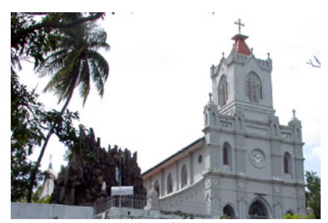
A church in Sri Lanka.

On June 19th, two other individuals who worked at the centre were travelling by bicycle when they were assaulted by a few people armed with iron rods. One of the Christian workers suffered an injury to his head, while the other sustained wounds to his hands. Both believers received medical treatment in hospital. That evening, the same perpetrators went to the homes of two other