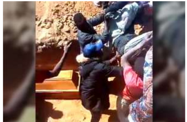
A burial on Christmas Day.

Please pray for the thousands of innocent Nigerians who were impacted by this most recent series of devastating attacks. Ask the Lord to minister healing to the injured victims and provide greatly needed comfort to those who are now mourning the tragic loss of their loved ones. Pray that He will also minister to the spiritual and practical needs of the many displaced believers who've lost their homes and/or livelihoods due to the violence. In the process, may God grant wisdom and guidance to the country's political and spiritual leaders, providing them effective strategies that will prevent further attacks from taking place against our Nigerian family in Christ and the unnecessary bloodshed of so many innocent lives.