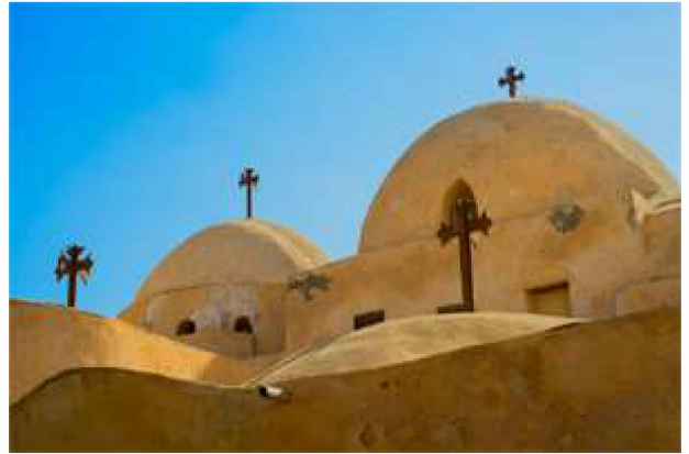
A Coptic church in Egypt.

While local police and security forces are continuing in their search for culprits of the attack, followers of Jesus in the community are fearful of further violence. For more information on the challenges experienced by Egyptian Christians, go to our country report .