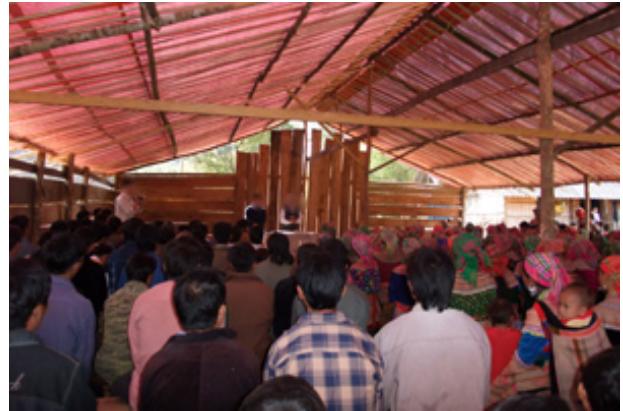
Pray that believers in Vietnam will remain faithful to Christ.