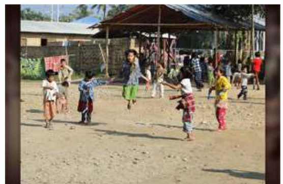
Children in Myanmar Photo: Flickr / EU Civil Protection and Humanitarian Aid (g;)