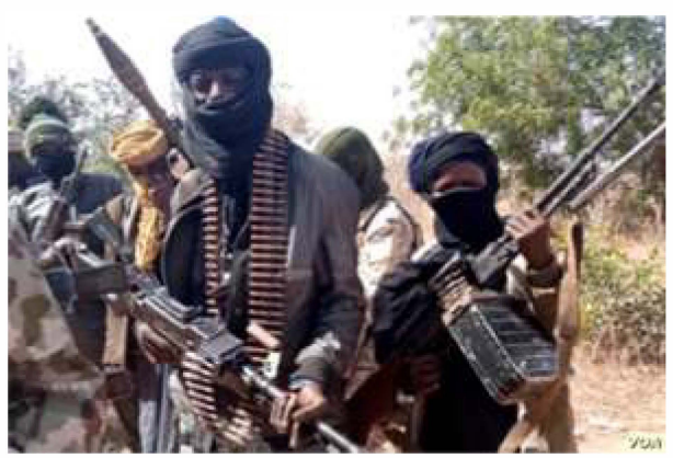
Terrorists in Nigeria

On November 24th, 18 Christians, including women and children, were on their way to church services in Azege village when they were suddenly gunned down by armed attackers. On the following weekend, other villages in the areas of Logo and Katsina-Ala were also attacked. During the December 1st attack, the assailants fired sporadically, killing many innocent villagers, while others died from machete wounds. By the end of the massacre, which lasted for several hours, at least 30 community members had been slain, several others injured, and the crops and properties of many were burned.