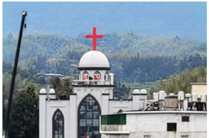
Yayang Christian Church

In the early morning hours of December 15th, more than 1,000 officers raided 12 congregations linked to the Yayang Christian Church. During the raids, authorities arrested hundreds of believers and detained key church workers. In the days following, police vehicles remained stationed outside the homes of several church members.