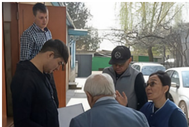
A previous raid at the Shu Baptist Church.

On October 26th, a church in Balpyk-Bi was raided by police officers mandating that the congregation be registered with the government. When the officers returned on November 19th, they demanded statements from all the attendees and, throughout the ordeal, forbid them from leaving. Those who refused to comply by giving a statement were then taken to the local police station. Charges were subsequently filed against nine members for holding a worship meeting without state permission. Thankfully, on December 24th, the judge dismissed all nine cases due to lack of evidence.